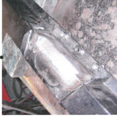
Gearbox rear mounting showing position from front of crossmember