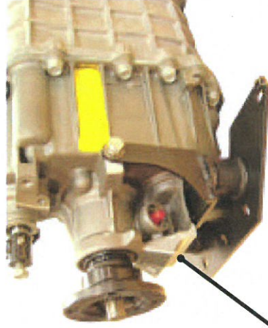
You may need to modify crossmember where shown if deemed insufficient clearance