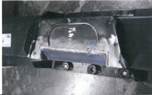
Gearbox rear mounting showing position from above crossmember

Only use SAE80 Gear oil, DO NOT use ATF (or any thin oil).